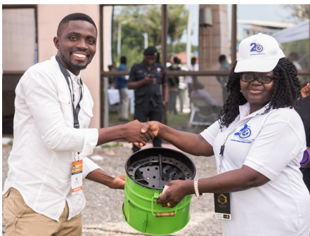
A participant who won an improved cookstove through a lucky dip supported by exhibiting businesses

Opportunity was also given to researchers from academic and private institutions to share findings from key renewable energy and energy efficiency researches conducted.