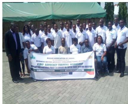
Advocacy training participants (Photo credit: Lovans Dwusu-Takyi, ISEES)

Thirty (30) members of the Biogas Association of Ghana have received training on effective policy advocacy to improve their business environment. The four-day training is part of a project to promote policy advocacy for the conversion of septic tanks into Bio-digesters.