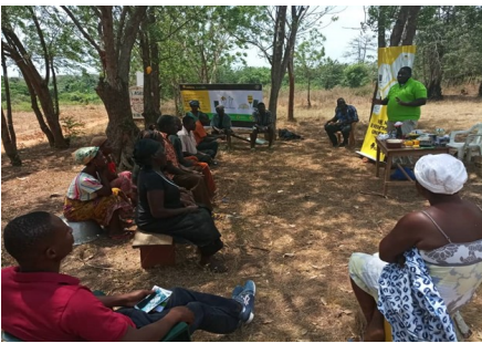
Installer training beneficiaries on the use of solar lanterns under the USAID Power Africa Project

Power Africa has contributed to electricity access in Ghana by facilitating the provision of solar home systems for lighting and other low power applications in 33,748 households as at September 2018.