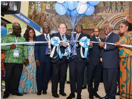
Official opening of the exhibition section of the Fair by the Vice President of Ghana and selected dignitaries

The Energy Commission together with the Ministry of Energy organised the 4th Edition of the Ghana Renewable Energy Fair from 9-11 October, 2018 at the Accra International Conference Centre. The theme for this year's event was "Renewable Energy: Exploiting Energy Resources at the District Level."