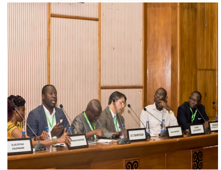
Debaters and expert discussants on the mini-grid Electrification Policy