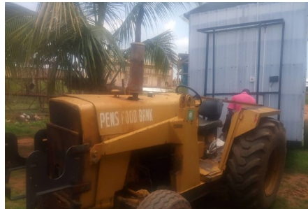
Mobile Solar Hybrid Dryer by PENS Food Bank

Permaculture, Aspire Food Group, Pee Farms, etc. Regions covered include the Ashanti, Brong Ahafo, Eastern, Greater Accra and Volta. The produce dried by this technology are maize, tiger nuts, moringa, rice, cassava, and mushroom.