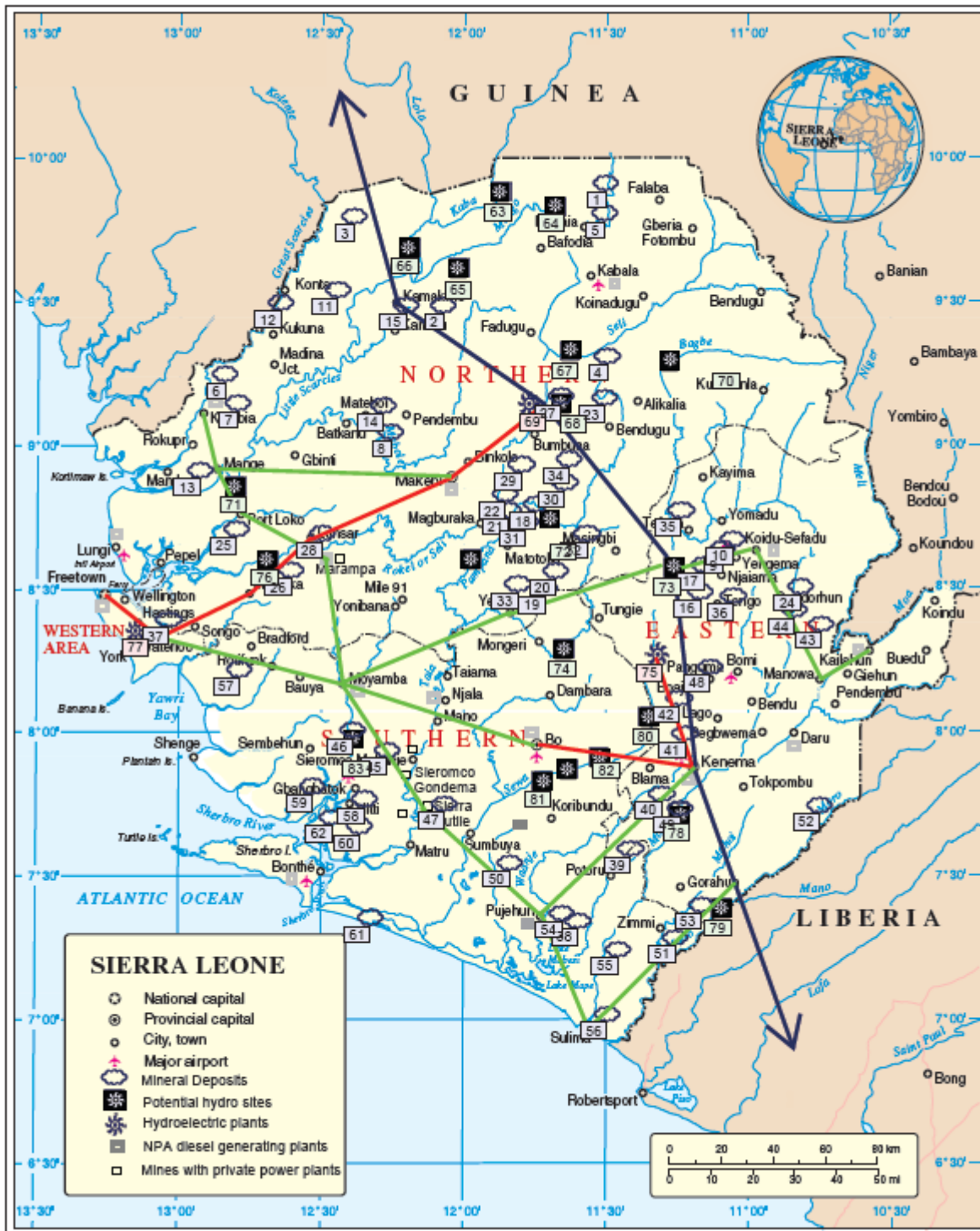
Figure 1: MAP OF SIERRA LEONE